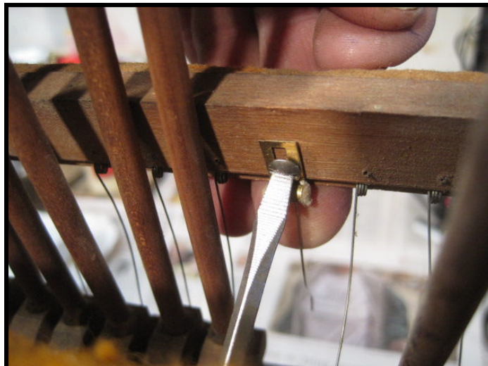
A hammer butt repair spring being installed.

For an on-the-spot replacement, a hammer butt repair spring may be used to replace a broken spring. The repair spring has a brass clip that may be screwed onto the hammer spring rail, as shown in the photo at the top of the next column.