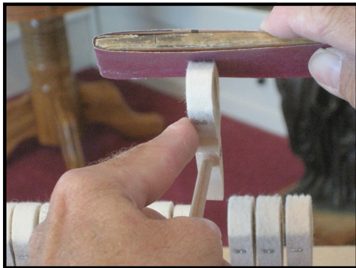
Hammers being filed to remove cut marks.

Repairs: Your grand piano action has thousands of individual parts, and after decades of use, breakage may occur or parts may simply wear out. The good news is that most of the parts found in a grand piano action (the working mechanism) do not often break and those parts that do happen to break or wear out commonly may be either replaced with parts available to the professional piano technician, or repaired to like-new condition.